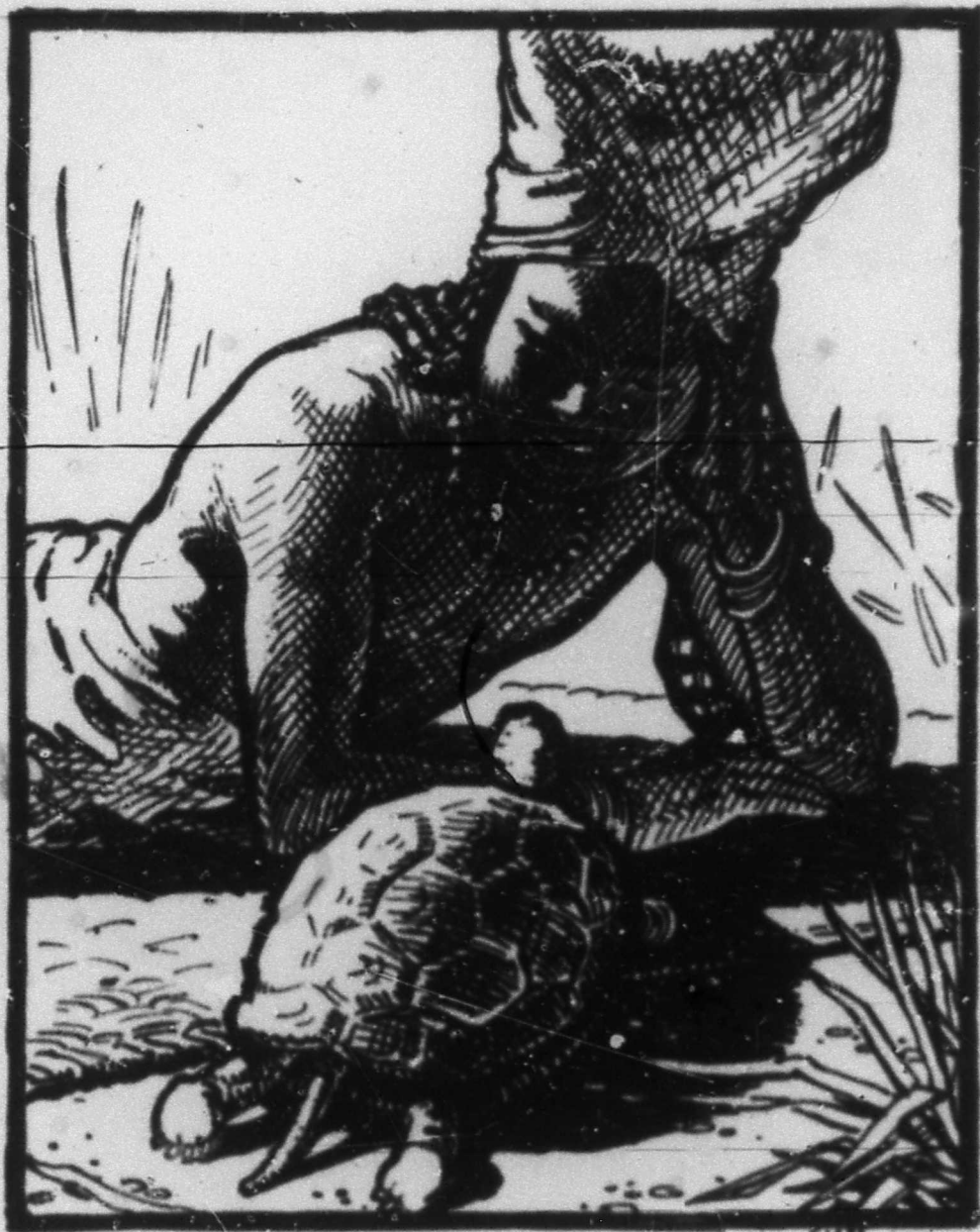
The Young King.