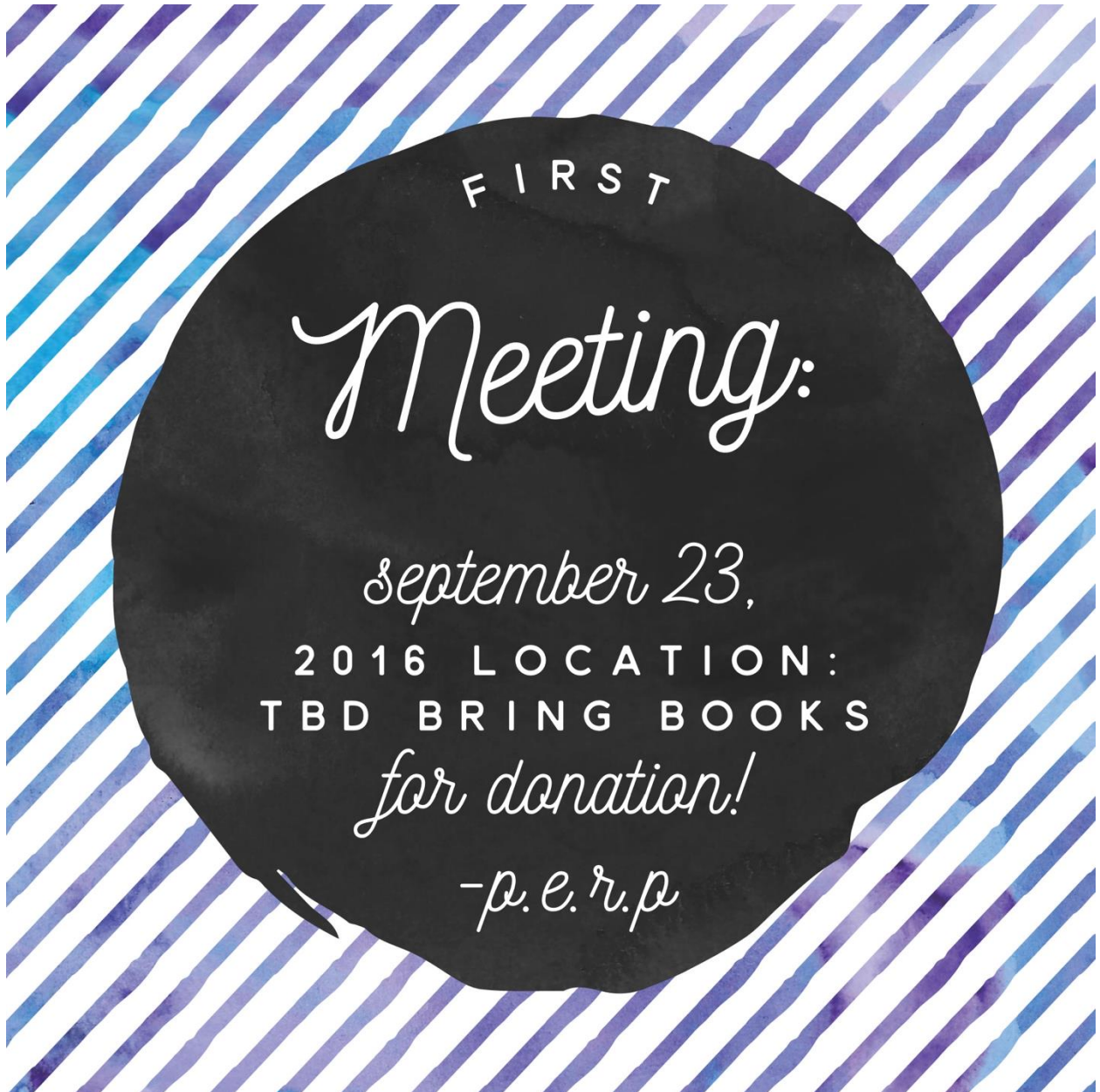
Fig. 1 Meeting Flyer