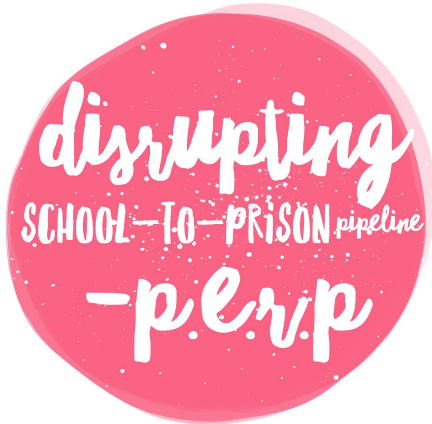
Fig. 2 Promotional Flyer