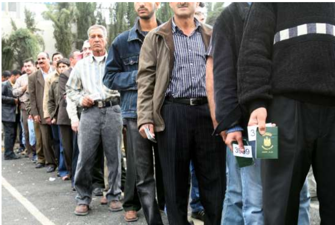
Iraqi refugees wait at a UNHCR office, near Damascus, Syria to register their names for residence, © Bassem Tellawi/AP/PA Photos, 23 April 2007

recent estimates suggest people are fleeing at faster rates than ever before. UNHCR recently predicted the number of newly displaced to be near 2,000 a day, equivalent to 80 an hour (day and night). 9