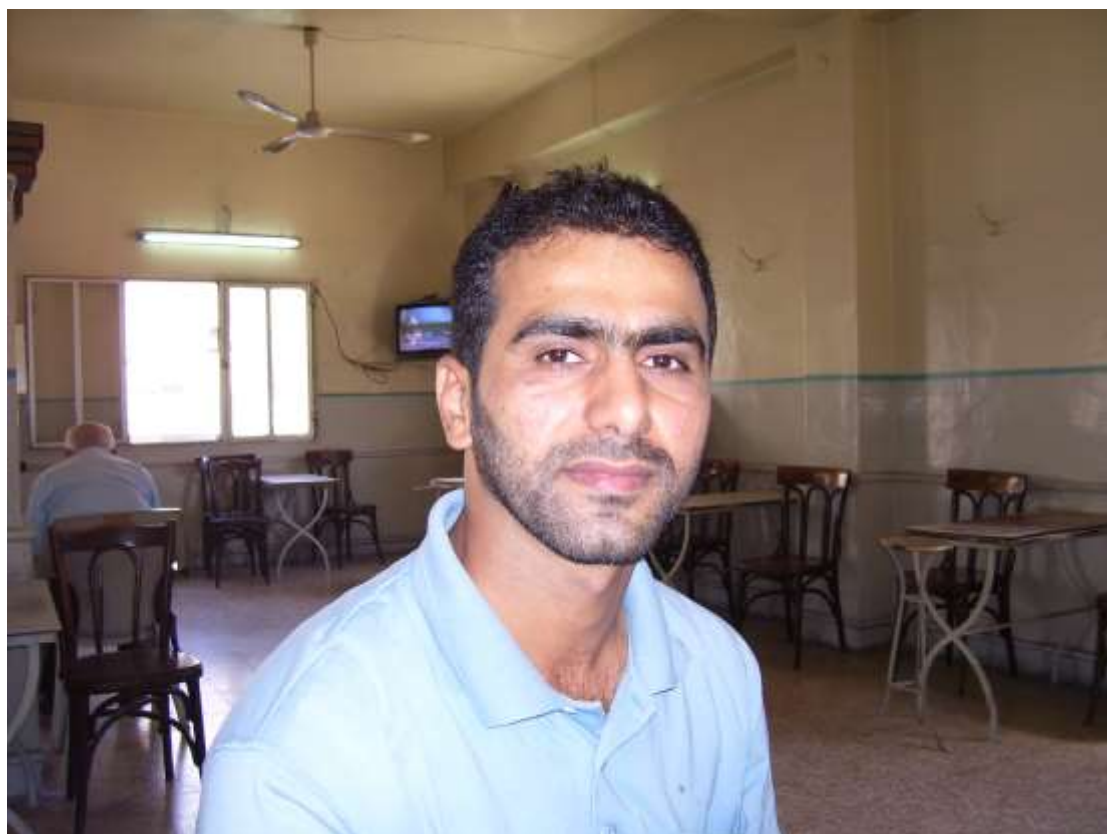
An Iraqi human rights defender from Basra, recognized by UNHCR as a refugee and awaiting resettlement from Jordan to Australia, © AI, Amman, September 2007

Australia has taken approximately 2,000 Iraqis a year over the past five years, and Amnesty International hopes the authorities will maintain this policy but increase its