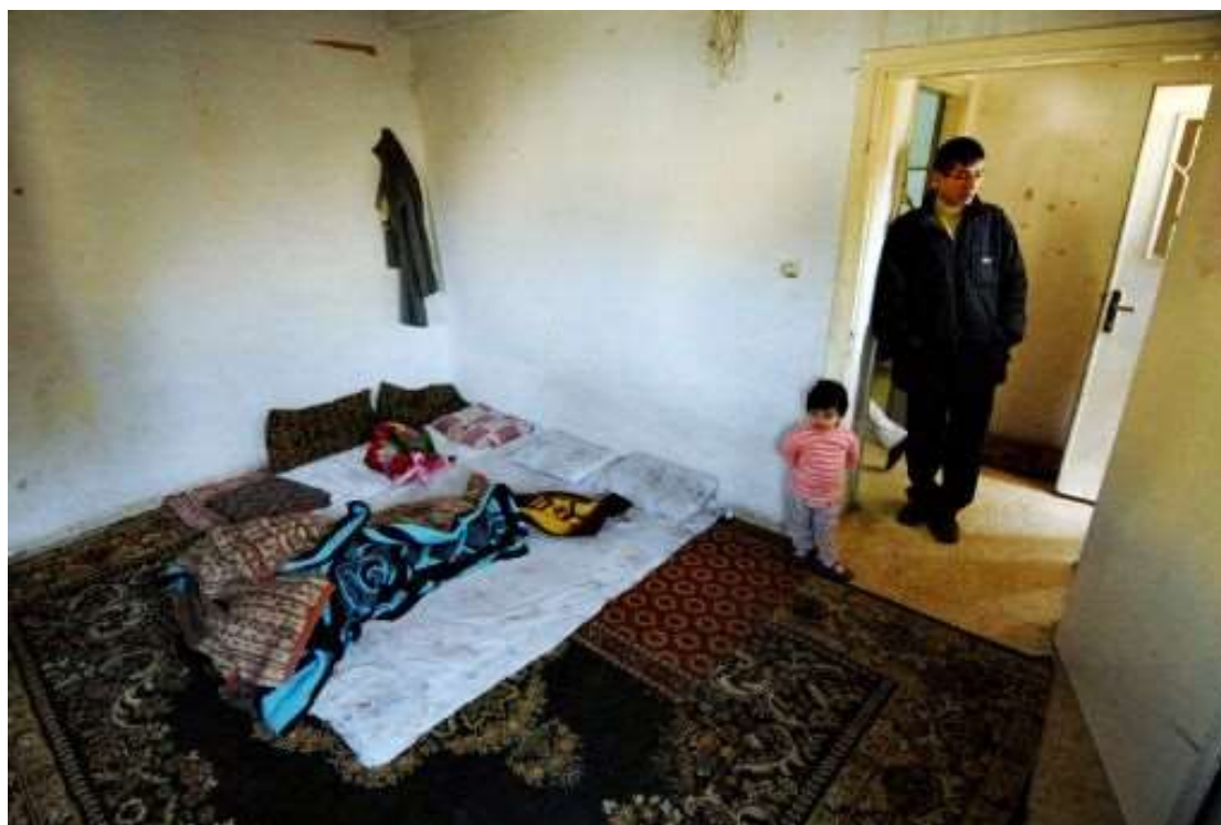
In Amman, most Iraqi refugees live in very basic and often crowded accommodation, © UNHRC/P.Sands, 12 September 2006

Amnesty International delegates were informed by a senior government official during their visit to Amman in September 2007 that the introduction of new visa restrictions, requiring that visas be issued before arrival at the border, was imminent. Such measures are aimed at clarifying the situation for many Iraqis who wish to leave Iraq and are currently selling their belongings to facilitate travel or taking real risks to reach the border, only to be turned away under the current approach to border entry operated by Jordanian officials. At present, only people with Jordanian residency, or certain categories of people such as those needing medical treatment certified by a hospital and those invited to attend seminars or conferences, are permitted entry. Amnesty International delegates were told by government officials that the intended