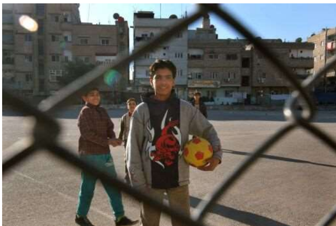
Young Iraqis playing football in a Damascus quarter, Syria © UNHCR/J.Wreford, January 2007

According to UNHCR and Syrian government officials, there are no restrictions preventing Iraqi children from attending schools in Syria. In June 2007 there were reported to be some 32,000 Iraqi children, aged between six and 18, attending public schools and about 1,000 children attending private schools. The total is low considering the estimated 1.4 million Iraqi refugees in Syria and the proportion of these who are likely to be children of school-going age. 22 Of the 33,000, some 30,000