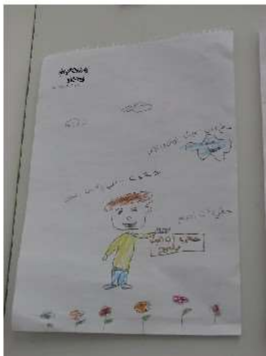
A drawing by an Iraqi child in Damascus with the Arabic writing saying, "I have the right to live in security and peace, I have the right to learn. I have the right to play and have fun." Syria, © AI, June 2007

Interviewed by Amnesty International in June 2007 in Syria