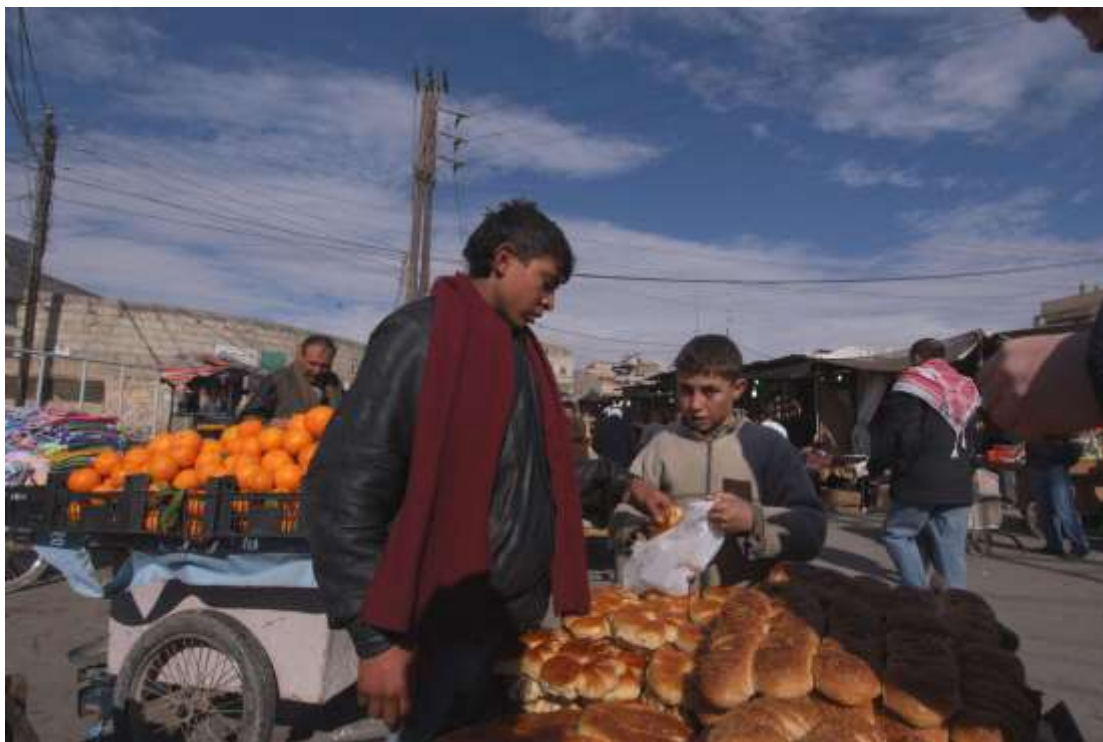
Iraqi refugees try to earn a living in the Sayida Zaynab market in Damascus, January 2007

exception exists for certain professional categories, 14 the overall effect of this unwelcome measure will be a closed border for those needing to flee and obtain protection. Similarly, Amnesty International delegates were informed on their recent visit to the Jordanian capital Amman that the imposition of visa restrictions for Iraqis wishing to enter Jordan is imminent. If so, these new restrictions will further cut off Jordan as a safe haven. Earlier this year the Jordanian authorities introduced a severely restrictive border entry procedure whereby only those with residency permits or invitations for medical or educational purposes have been permitted to pass through the border.