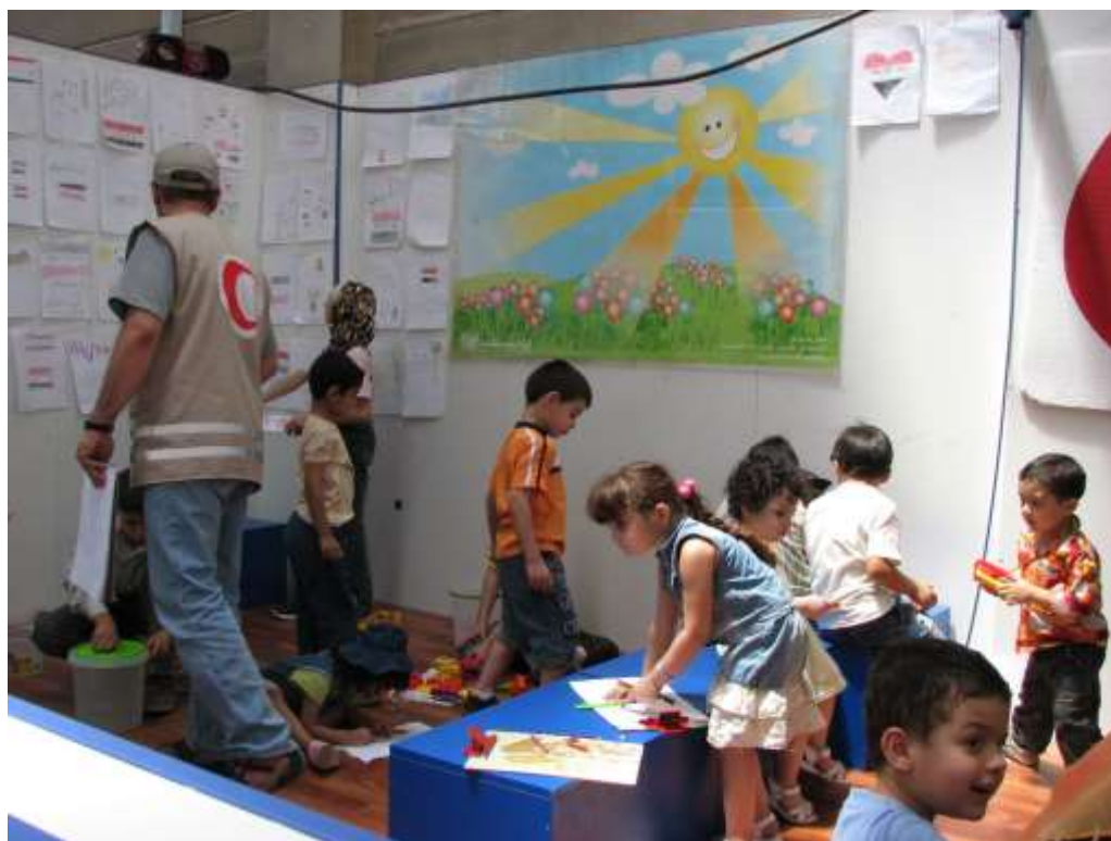
Iraqi refugee children being looked after by a volunteer of the Syrian Arab Red Crescent Society while their families are waiting to be registered with UNHCR in Damascus, Syria, © AI, June 2007

thirds of the 33,000 were attending schools in Greater Damascus. There are 5.3 million children attending schools in Syria nationwide.