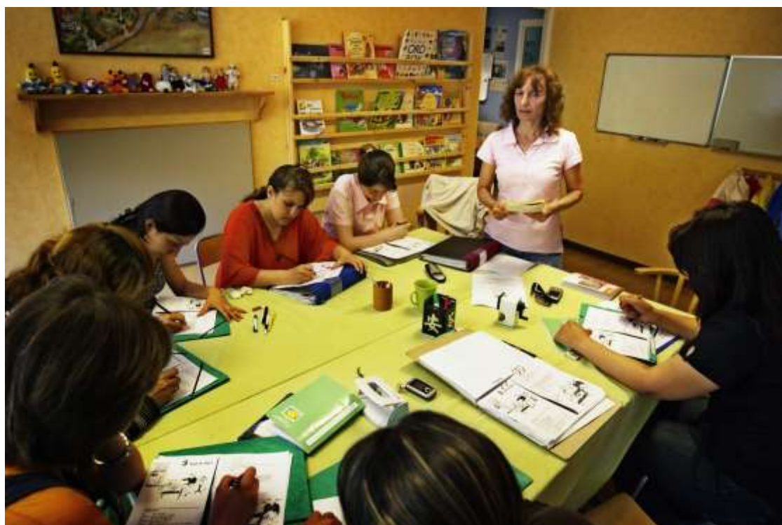
Iraqi refugees learn Swedish at a school in Södertälje, Sweden, June 2006

As highlighted above, Amnesty International currently opposes all forcible returns to any part of Iraq. As such, in order to avoid a situation whereby individuals that reach the end of the asylum process become destitute and as such may be compelled to leave the host country due to the inability to meet their basic daily needs such as shelter, food and healthcare, rejected Iraqi asylum seekers should receive financial support and accommodation if needed with the same entitlements and rights as provided during the asylum process; be given permission to work; full access to health care, all levels of education and right to claim benefits until their situation is resolved.