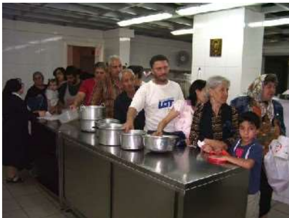
Iraqi families receive a cooked meal from a charity in the Jaramana district of Damascus, Syria, June 2007

When Iraqis cross the border their passports are stamped banning them from working. However, many Iraqis do take paid work illegally and they have become for local employers a cheap workforce. The Syrian authorities are aware of this and tolerate it. They have also taken advantage of the presence of professionals such as medical doctors, teachers and engineers among the Iraqi refugees by issuing them with work permits and allowing them to take jobs in Syria.