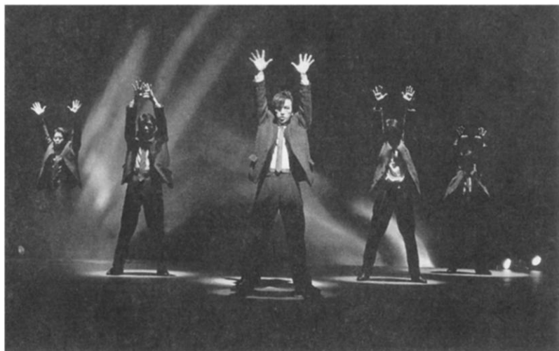
2. A scene from Asahi no Yona Yuhi o Tsurete (With a Rising Sun Which Looks Like a Setting Sun) by Kokami Shoji. A production by The Third Stage, February and July 1985, Kinokuni-ya Hall, Tokyo, Japan.

a manga magazine for young adults ( Young Magazine , published weekly by Kodan-sha) in 1982. Like Kitamura's play, Akira 's story begins when the world ends in 1982 because of World War III (plates 3–6). In relation to these kinds of subcultural representations, shō-gekijō practitioners, some would argue, chose images of the apocalyptic as an appropriate, though cheap, metaphor for the world they were forced to live in; the world in which, to quote Yasumi again, “euphoric nothingness” was the only shared and sharable sentiment, where “traditional value systems are declared dead” (1995b:167). It is tempting to interpret the themes of 1980s theatre culture as such; the apocalyptic is an easy metaphor for “childish” theatre practitioners who cannot face the real world.