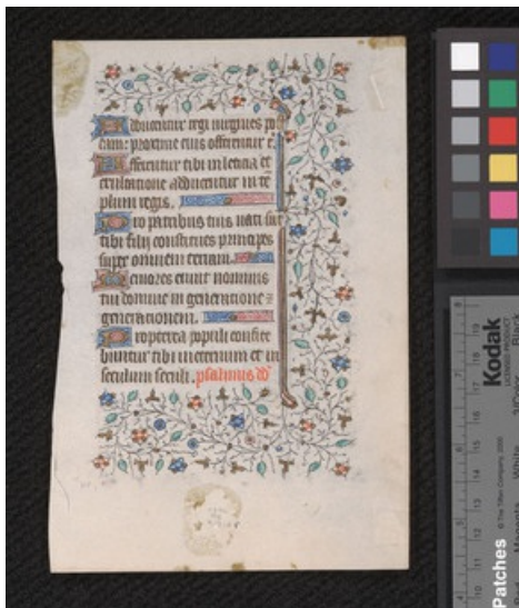
f. 1r Reverse C--shaped border with pale green leaves and face-on flat 4-petal flowers; illuminated initials.

Notes: Contains Psalms 44-45 (incomplete)