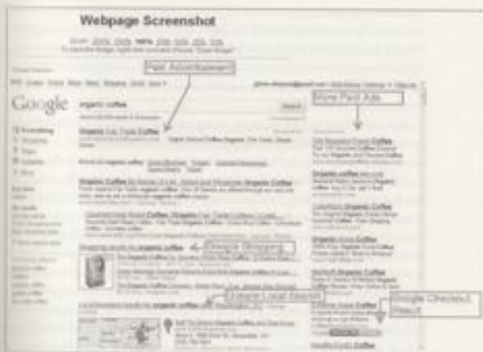
Figure 1.11. Example of Google's prioritization of its own properties in web search. Source: Inside Google (2002).

To understand search in the context of this book, it is important to look at the description of the development of Google outlined by the former Stanford computer science graduate students and cofounders of the company, Sergey Brin and Larry Page, in "The Anatomy of a Large-Scale Hypertextual Web Search Engine." Their paper, written in graduate school, serves as the architectural framework for Google's PageRank. In addition, it is crucial to also look at the way that citation analysis, the foundational notion behind Brin and Page's idea, works as a bibliometric project that has been extensively developed by library and information science scholars. Both of these dynamics are often misunderstood because they do not account for the complexities of human intervention involved in vetting of information, nor do they pay attention