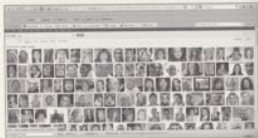
Figure 1.8. Google Images results when searching the concept "ugly" (did not include the word "women"), January 4, 2015.