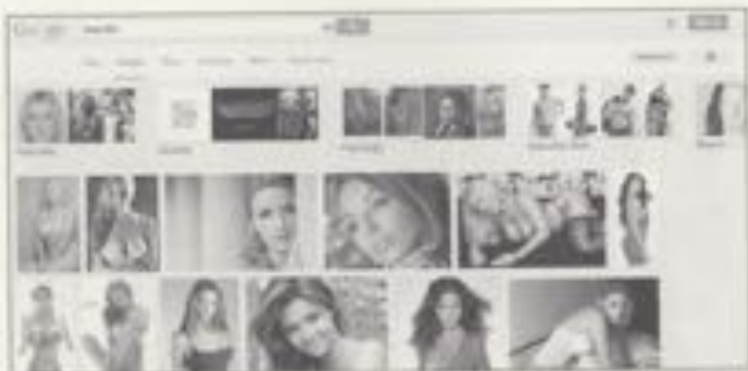
Figure 1.7. Google Images results when searching the concept "beautiful" (did not include the word "women"), December 4, 2014.