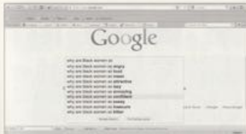
Figure 1.5. Google autosuggest results when searching the phrase "why are black women so" (January 25, 2015).