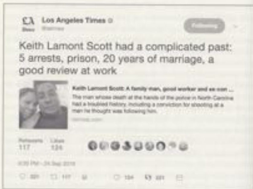
Figure 3.11. Automated headline generated by software and tweeted about Keith Lamont Scott, killed by police in North Carolina on September 20, 2016, as reported by the Los Angeles Times.