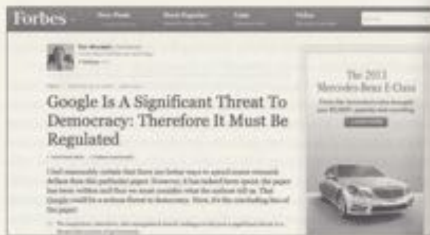
Figure 1.15. Forbes's online reporting (and critique) of the Epstein and Robertson study.

"American's Privacy Strategies Post-Snowden," only 34% of respondents who were aware of the surveillance that happens automatically online through media platforms, such as search behavior, email use, and social media, reported that they were shifting their online behavior because of concerns of government surveillance and the potential implications or harm that could come to them. 48 Little of the American public knows that online behavior has more importance than ever. Indeed, Internet-based activities are dramatically affecting our notions of how democracy and freedom work, particularly in the realm of the free flow of information and communication. Our ability to engage with the information landscape subtly and pervasively impacts our understanding of the world and each other.