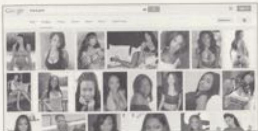
Figure 1.3. First page of image search results on keywords "Black girls," April 3, 2014.