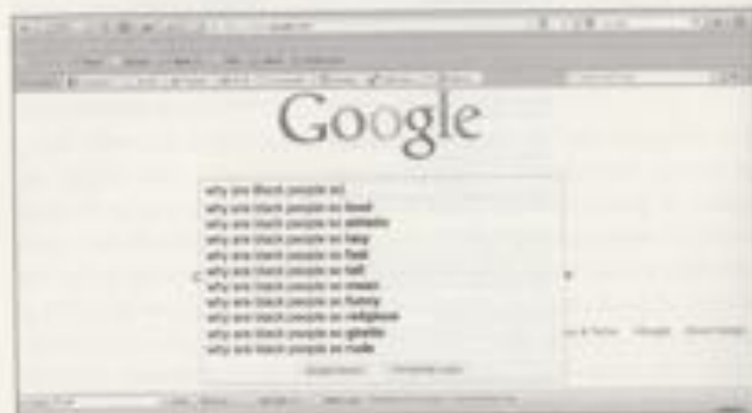
Figure 1.4. Google autosuggest results when searching the phrase "why are black people so" (January 25, 2015).