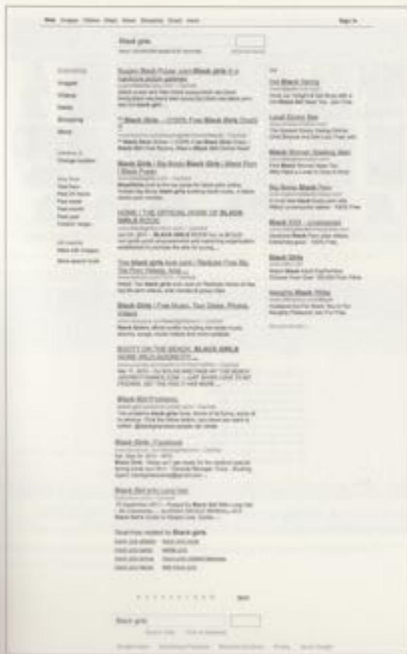
Figure 2. First page of search results on keywords "Black girls," September 26, 2001.

Of course, upon reflection, I realized that I had been using the web and search tools long before the encounters I experienced just out of view of my young family members. It was just as troubling to realize that I had undoubtedly been confronted with the same type of results before but had learned, or been trained, to somehow become inured to it, to take it as a given that any search I might perform using keywords connected to my physical self and identity could return pornographic and otherwise disturbing results. Why was this the bargain into which I had tacitly entered with digital information tools? And who among us did not have to bargain in this way? As a Black woman growing up in the late twentieth century, I also knew that the presentation of Black women and girls that I discovered in my search results was not a new development of the digital age. I could see the connection between search results and tropes of African Americans that are as old and endemic to the United States as the history of the country itself. My background as a student and scholar of Black studies and Black history, combined with my doctoral studies in the political economy of digital information, aligned with my righteous indignation for Black girls everywhere. I searched on.