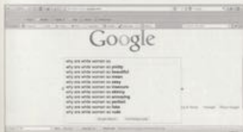
Figure 1.6. Google autosuggest results when searching the phrase "why are white women so" (January 25, 2015).