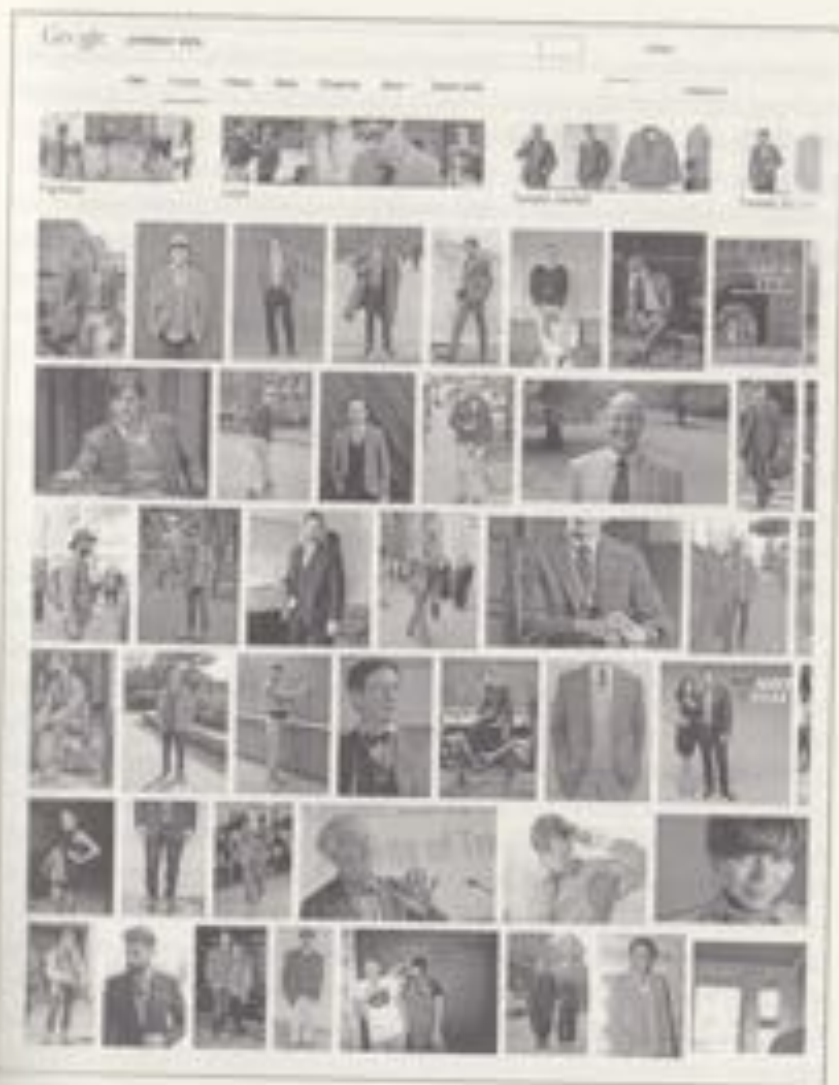
Figure 1.9. Google Images results when searching the phrase "professor style" while logged in as myself, September 21, 2015.