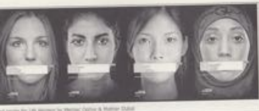
ad series for UN Women by Mennac Ogilvy & Mather Dubai