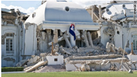
Buildings such as the presidential palace should have been built to higher standards, an OAS official says.

(CNN) -- A study by the Organization of American States concluded last month that many of the buildings in Haiti were so shoddily constructed that they were unlikely to survive any disaster, let alone an earthquake like the one that devastated Port-au-Prince on Tuesday, the man who supervised the report said Wednesday.