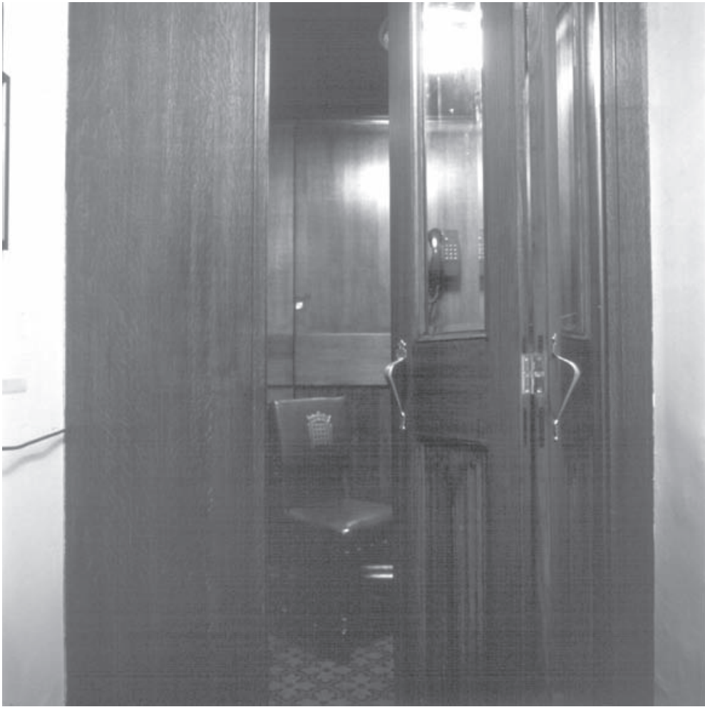
Figure 4 Jane and Louise Wilson, Peer's telephone , House of Lords, Parliament, 1999. C-type print mounted on aluminium 180 cm × 180 cm.

I always think that the House of Commons itself, in its corridors when you sort of look at the lobbies and things, it's a cross really between a cathedral and a public boys' school and that's still the ethos that pervades the place ... it's the whole history of Parliament. It was a place where gentlemen with a gentlemen's profession came after they had had a good lunch and really in lots of ways that kind of ethos has not changed. We still have people dressed up in eighteenth-century costumes and stockings and buckle shoes. I mean it's a bizarre institution, it's one in which people, men, well almost entirely men, are completely addicted to this kind of ancient regime and it pervades everything. (Labour Party female MP)