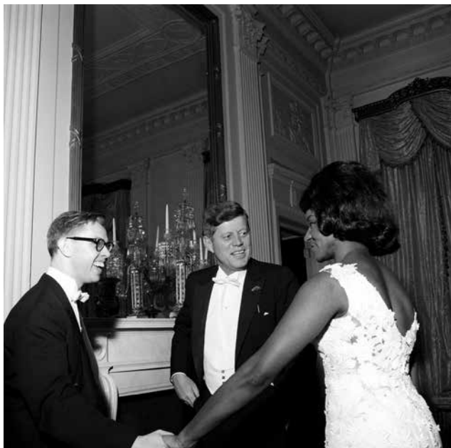
President Kennedy with Opera Singer Grace Bumbry and Pianist Charles Wadsworth, 1962

figures of the (American) past. How much and to what purpose the new history relied on the old is evident from Kennedy's text entitled The Arts in America and published in 1962 in Look magazine. 43