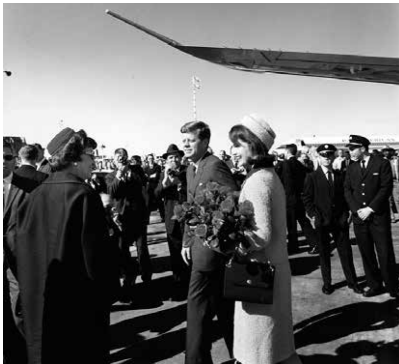
President and Mrs. Kennedy arrive at Love Field, Dallas, Texas, 1963

image the world had of him, above the rim of the car. Then I made some crucifixes. I didn't want them to be recognized as crucifixes but as floral forms reaching up in growth or flight." 78 The sense of a certain religious rapture—present with de Kooning ever since her struggle to find a proper way of creating the portrait—is evocative of the Byzantine legend on the creation of the first icon: King Avgar sent his finest painter to paint the portrait of Christ. The painter never seemed to manage to capture Christ's image as, according to John of Damascus, his model shone with "unbearable light". Finally, taking pity on the artist Christ pressed his face onto his robe where the imprint remained. Although Kennedy could not have taken the same kind of pity on Elaine de Kooning, the similarities between these two stories exist. John of Damascus, during the period of iconoclasm used the story to clarify the origin of icons, defending them by saying that the first icon was "created" by Christ himself. Thus Kennedy from the outset creates his own image, fighting