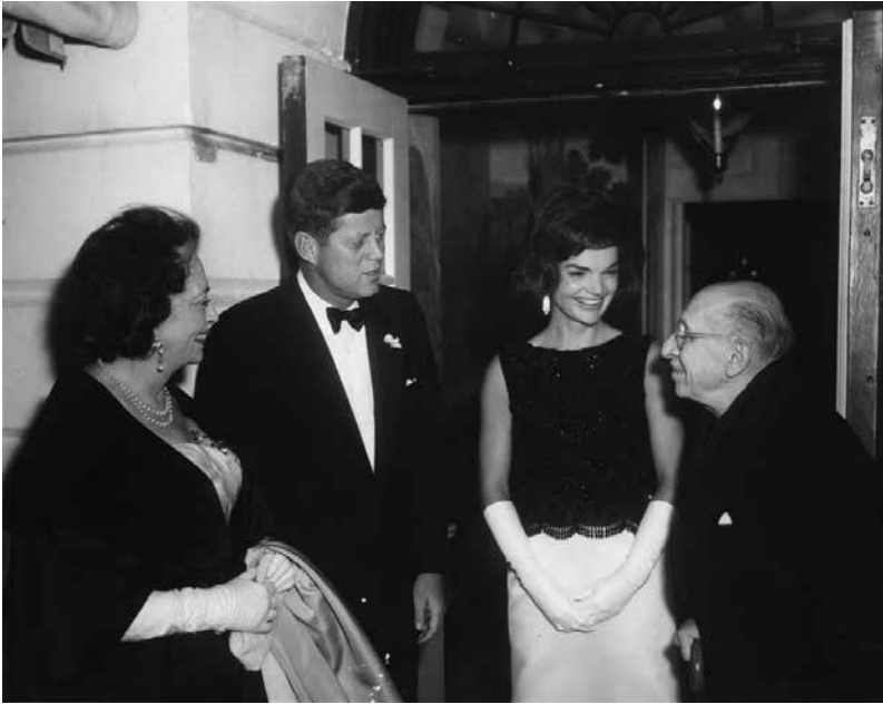
Igor and Vera Stravinsky arrive at White House, 1962

only towards culture, but above all towards history, American history especially. 41 On February 14, 1962 A Tour of the White House with Mrs. John F. Kennedy was broadcasted on all three television networks at that time (ABC, CBS, NBC). The tour was filmed and distributed to 106 countries. "It's so important the way the presidency is presented to the world," Jacqueline Kennedy would state briefly, openly and pithily. For this show, which was seen by 80 million viewers in America, only the First Lady would receive an honorary Emmy Award in 1962. The historical progress embodied in the development of culture and enlightened governance completed the image of power, signaling Kennedy's plans to position the country not only as politically and militarily dominant, but also as a leader of culture and civilization. As he said, "I look forward to an America which commands respect throughout the world not only for its strength but for its civilization as well." 42 The aforementioned cultural events were intentionally organized to promote another image of Kennedy: the leader of the free world, fighter for democracy and human rights with respect for history and the true heir of the major