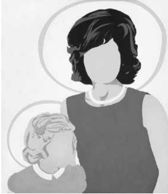
Allan D'Arcangelo, Madonna and Child, 1963, Whitney Museum of American Art, New York

against criticisms concerning idolatry. However, John of Damascus also teaches us that we venerate God, but we also venerate things, places and people associated with God. 79 What happened after (the crucifixion/assassination) is heralded by the painting Madonna and Child (1963) by Allan D'Arcangelo. Here is the president's widow in a modern dress with pearls around her neck and her daughter beside her rendered as a contemporary icon; it signifies the process of beatification which started with her Camelot interview. The image thus becomes iconic and equated with the concepts of time and permanence in their archetypal dimensions in order to subtly, by connecting with the contemporary moment, form a new meaning and its own narrative stereotype. Using her privilege of what Damascus called "people associated with God" the President's widow in the days after the assassination performs another intervention upon history. Wanting to save him from history written by "all those bitter old men" 80 —" [s]he did not want Jack left to historians"—she attempts to forestall them by utilizing the legend of Camelot as an epitaph for the Kennedy administration. "Myth turned into a cliché" as