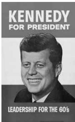
Kennedy for President, Campaign poster, 1960