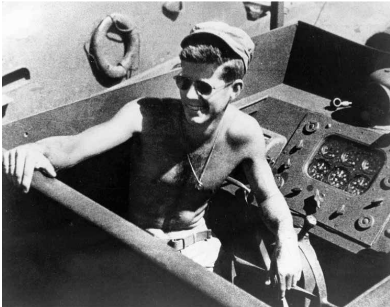
Lt. John F. Kennedy aboard the PT-109 in the South Pacific, 1943 Photograph in the John F. Kennedy Presidential Library and Museum, Boston

image repeated and occupying the entire visual space. In the process of creating the “acceptable” painting, without necessarily being aware of it, de Kooning exhausts herself with images, systematically distancing herself from clarity, through adapting her own mind to the ways of observing and the expectations of those the portrait is intended for: those whose attitude towards the Kennedys Thomas McEvilley vividly describes by saying “their faces are our property.” 64 Through this process she simultaneously shows that the recognizable Kennedy image is a carefully created applied projection and an artifact of mass culture. This is the reason why de Kooning cannot manage to reach the painting she feels would fulfill expectations while working with a live model. Only as the impression is corrected through the medium of photography, a drawing made based on a TV appearance or some other mediated image, can she reach what Kennedy really is. Her own private image of him, her truth, she keeps for herself as shown and the last thing she might want is to share it with Jackie Kennedy who, in the years after the assassination, came to represent the metonym for the constructed Kennedy image.