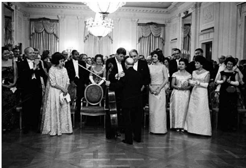
President Kennedy, Pablo Casals, and Governor of Puerto Rico Luis Muñoz Marín, 1961