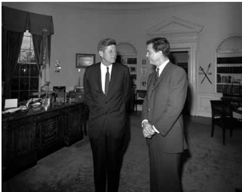
President John F. Kennedy meets with actor Cliff Robertson, Oval Office, White House, 1963