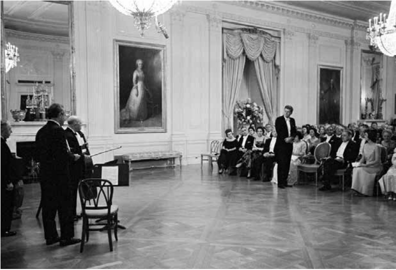
Pablo Casals performs at White House, 1961