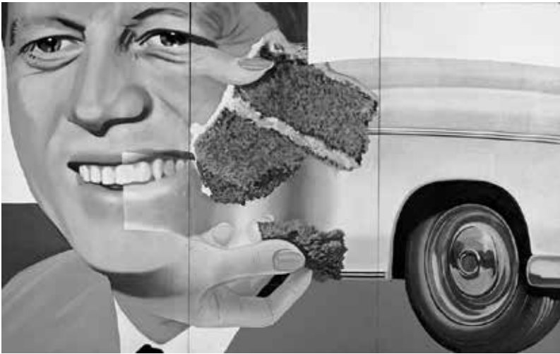
James Rosenquist, President Elect, 1960-1961/1964, Musée National d'Art Moderne, Centre Georges Pompidou, Paris