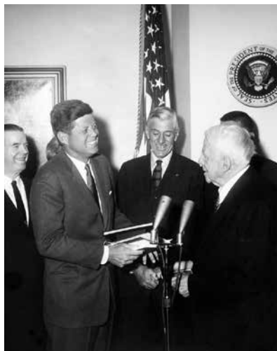
President John F. Kennedy presents Congressional Gold Medal to Robert Frost, 1962