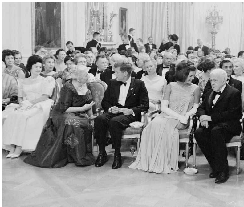
Dinner in honor of 49 Nobel Prize Winners from the Western Hemisphere, East Room, White House, Washington, D.C. 1962. (L-R) Lady Bird Johnson; Pearl S. Buck; President John F. Kennedy; First Lady Jacqueline Kennedy; Robert Frost.