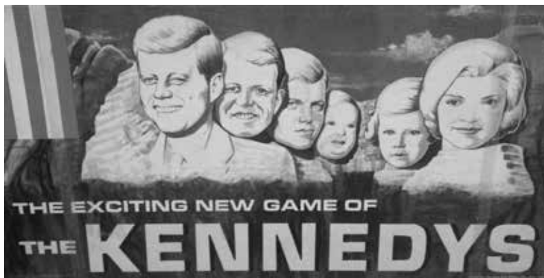
The Exciting New Game of the Kennedys, 1961

“American,” from the title of the work/series, an element like the flag and the combination of patriotic colors. The titles “The President of The United States” and “Old Glory” written beneath both of these motifs form an unbreakable bond. The President’s promotional photograph, however, can in its original purpose belong to a sequence of ads as well. In other words, immaculately groomed and carefully stylized, JFK is being advertised in the same way as the “world’s finest” Wolfschmidt’s vodka and the juicy fruit seen beneath his photograph. Within a multidimensional process of appropriation the Kennedy image becomes an integral part of a certain patriotic performance of image de-elitization and democratization.