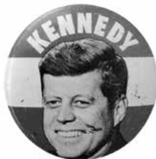
JFK campaign button, 1960