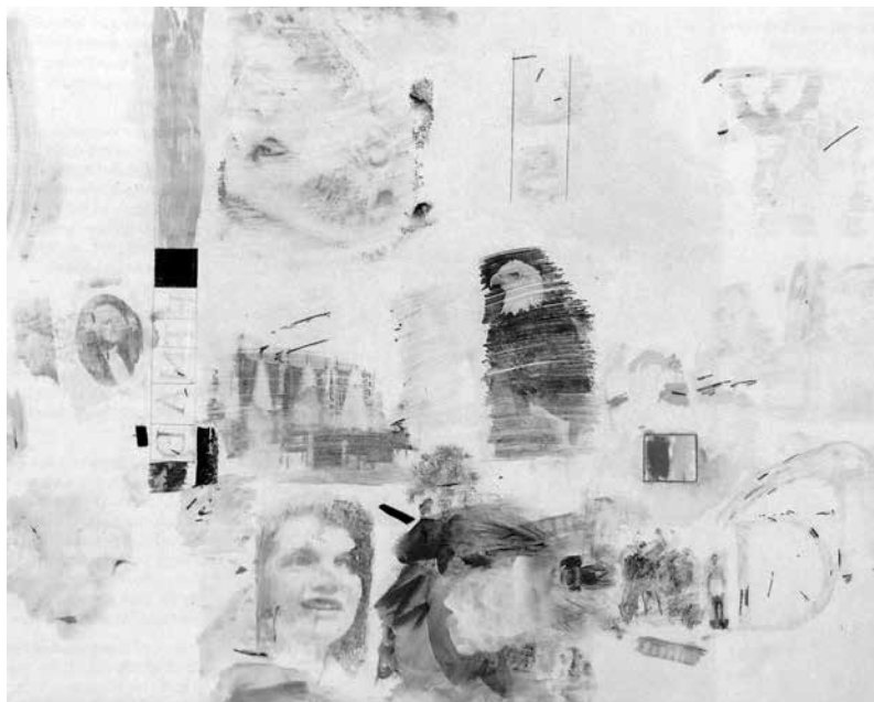
Robert Rauschenberg, Election, 1960, Private Collection

calling for respect for the history and culture of the past, shown in “his own medium”, actually becomes an indirect statement as to Rauschenberg’s own right to belong to this history. “The Greek head and Washington” (a head of a sculpture of Aphrodite and portrait of George Washington) leads us directly to the issue of John Kennedy’s inauguration and the Augustan Age (which I analyze more thoroughly in the following section). The new history built its own historicity by appropriating and equating with the mythologized ideals of the past. According to Gotthold Ephraim Lessing’s influential 18th-century discussion on narrative in the visual arts, the painter, as opposed to the poet, is limited to the key moment of the event he represents by the boundaries of his own medium. His choice therefore needs to be very carefully made so that based on this one moment the full significance of the event could be gleaned. However, even if he does strive for historicity, Rauschenberg does it through a completely different technique. By abandoning the logic of the key moment of the event in favor of a narrative sequence the author rejects the traditional definition of theme, the meaning that the theme possesses and its time frame.