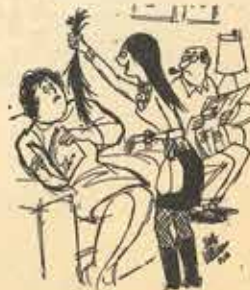
"He really digs me. Mom! He even gave me a lock of his hair."

He worked for the Department of Parks and Recreation for 10 years.