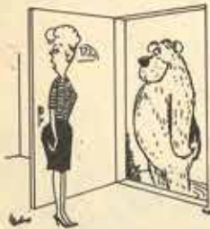
"Junior, did you invite anyone from camp to visit us?"

College professor to his class: "If there are any dumbbells in this class, please stand up." After a short pause, a strapping youth in the back of the room rose. "So, you consider yourself a dumbbell," the professor remarked. "No sir," replied the youth, "I just hated to see you standing there alone."