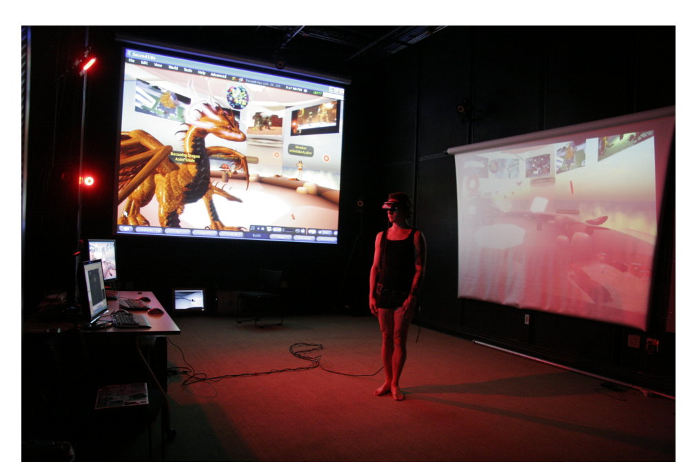
Fig. 3: Full Installation View, Photo by Elle Mehrmand

My physical recovery was quick. Only 2 days after the performance I visited Student Health Services on campus and had my vision tested, and it had returned to 20/20 already. They also tested my blood pressure and found it to be slightly high, and slightly higher than before the performance. My lack of appetite surprisingly continued for a few days. During the performance I persistently felt sick instead of hungry, and this feeling of sickness when I was hungry persisted for about 4 days. In addition, as long as 5 days after the performance I had small moments when turning my head where my eyes did not move properly with my head movement, giving me a brief sensation of slight dizziness and disorientation. After 6 days, I still felt that I had some trouble remembering occasional real world facts, but it is hard to quantify these instances and separate them from regular forgetfulness. After a week I felt that all symptoms from the performance had subsided.