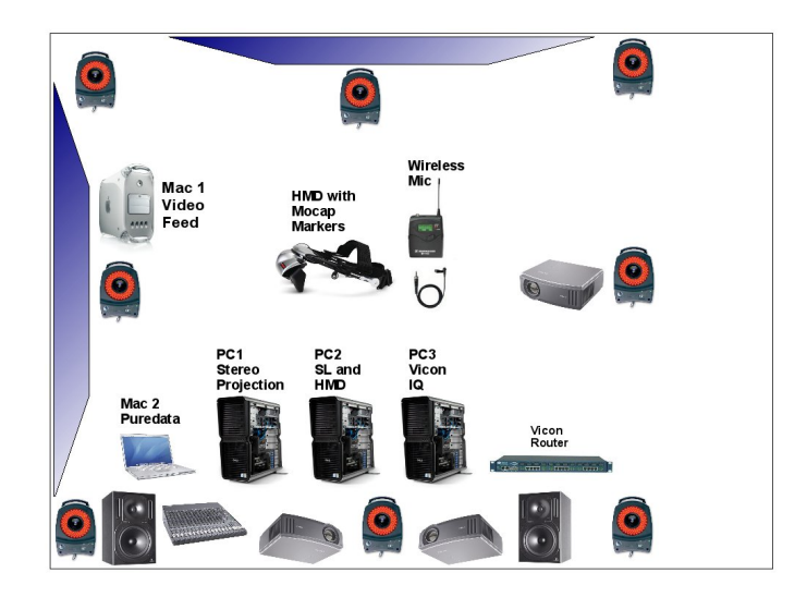
Fig. 1: Installation Layout Overhead View

The technical requirement for using the Vicon motion capture system as a means of spatial navigation within Second Life was to provide the ability to access live data from the local Vicon system located in the lab at CRCA from within Second Life. The primary Vicon desktop application used for recording motion data, "ViconIQ", also provides the facility to transmit positional information in real-time. Unfortunately this function of ViconIQ is closed in the sense that it is poorly documented. It would have been possible to glean information about the transmission format by watching the live network stream, but we didn't have nearly enough time to re-implement the entire protocol from scratch.